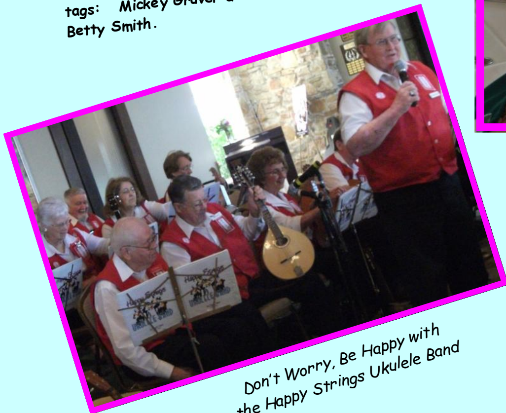
Don't Worry, Be Happy with the Happy Strings Ukulele Band